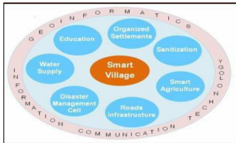
Fig1: Core Smart Village

Imbalance growth between rural and urban landscapes leads to the challenge of rapid in already crowded Indian urban masses. One of the main consequences of uncontrolled urbanization is lack of livelihoods, good standard of living and amenities in the villages of India. Smart village concept may play crucial role in maintaining the balance between the development of rural and urban areas and help to reduce migration of rural population in urban areas. Urban population density is increasing in uncontrolled manner, while the numbers of cities are still inadequate to accommodate the migrating population from villages. This needs to be reversed and suitably managed to improve quality of life in Indian cities. The concept of “Smart Village” will also address the multiple challenges such as unplanned urbanization, under-development of villages, migration for economic pursuits, better standard of living etc